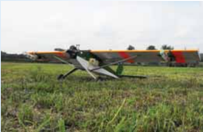
One of the UAVs used to study the phytophthora infestans crop disease. Air collection sampling devices are closed underneath the wings.

F arming seems to present a perfect challenge for unmanned systems: The work is sometimes dull, often dirty and occasionally dangerous.