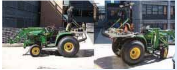
The University of New South Wales’ Robotic Seeding Instrument.